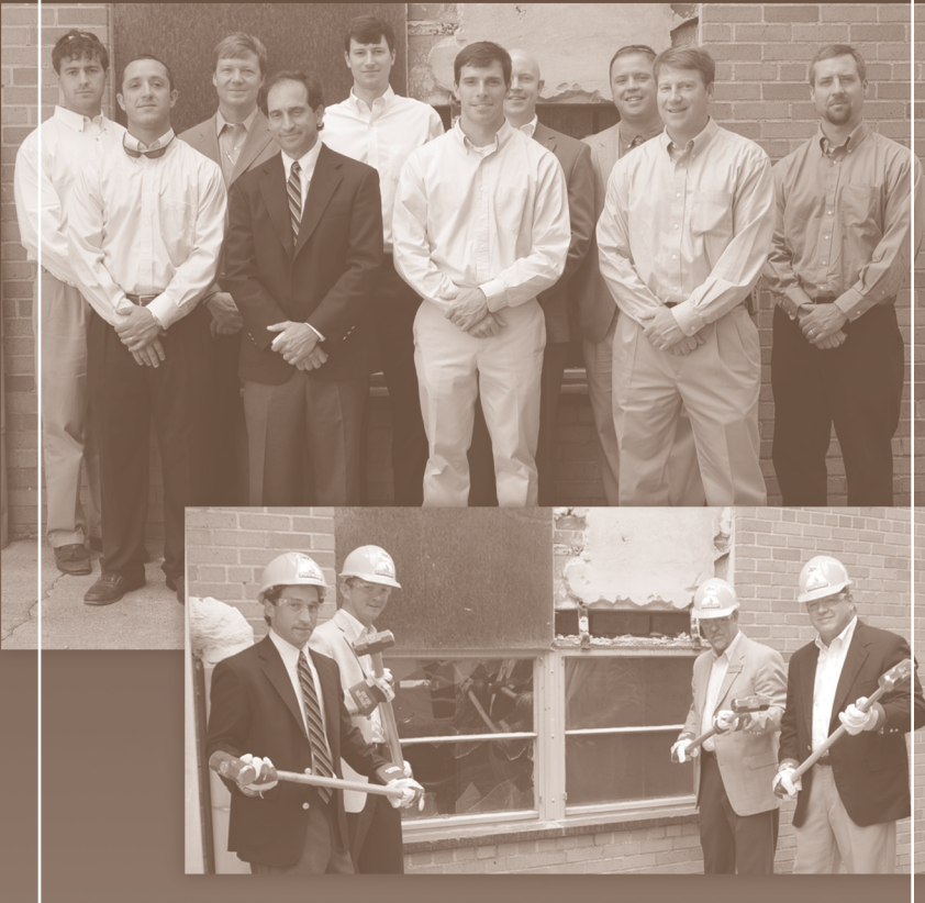
Above: Representatives from ABC-Alabama's ABC Cares Committee of caring construction companies!