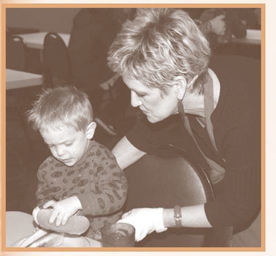
Residents of our Women's Recovery Program discover a healing satisfaction in reaching out to needy families and the lonely elderly.

"These women have come to The Foundry so wounded. When they begin to see others who hurt and have needs, it takes